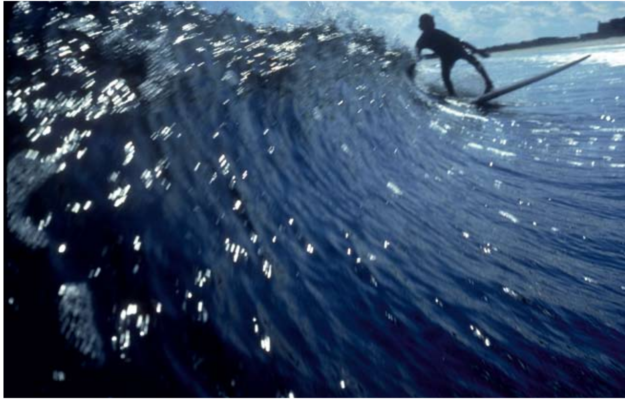
Left: Dede Suruyana air, Roti Island rights.