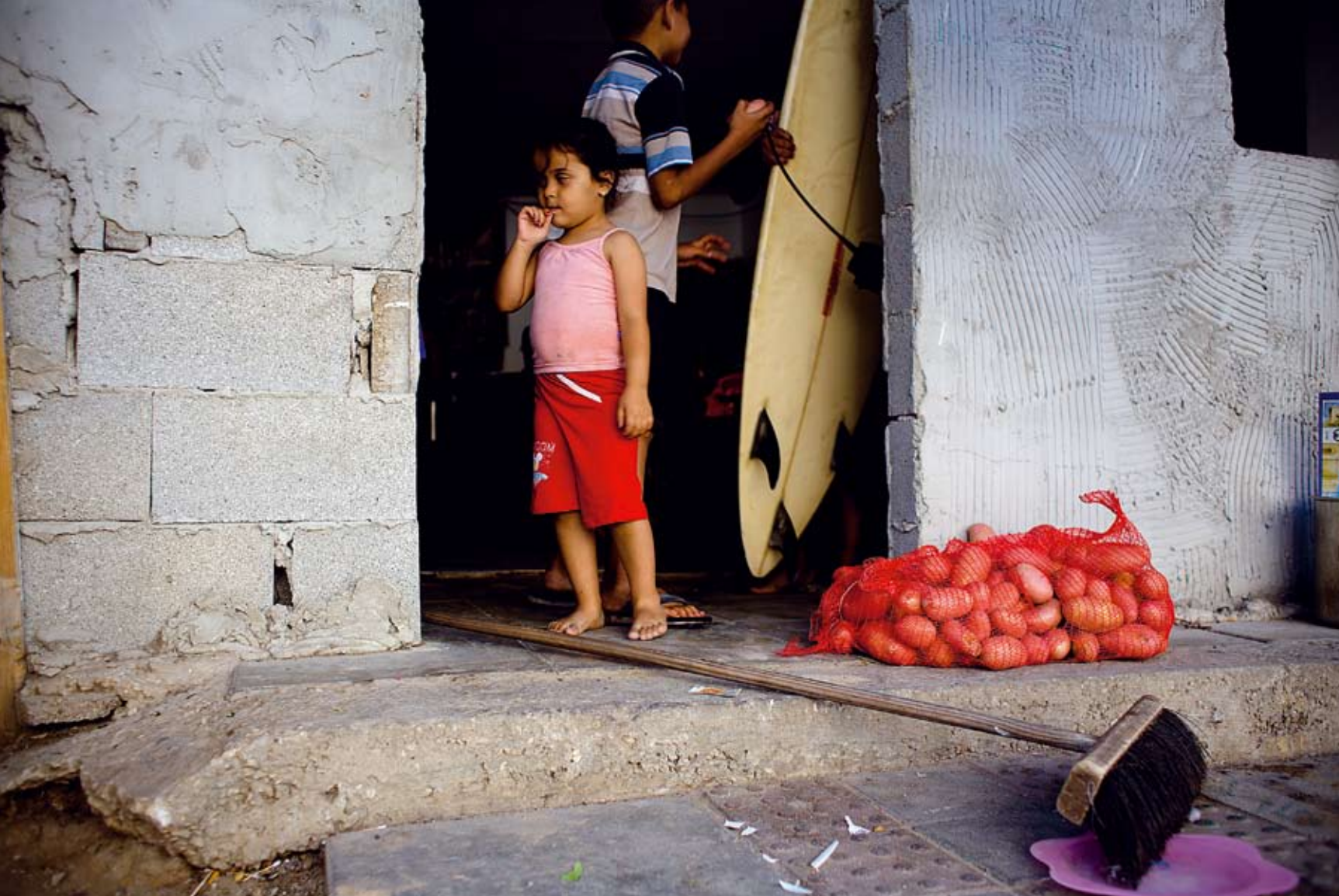
Left: Dede Suruyana air, Roti Island rights.